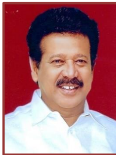
Thiru. K. Ponmudy Pro-Chancellor Hon'ble Minister for Higher Education